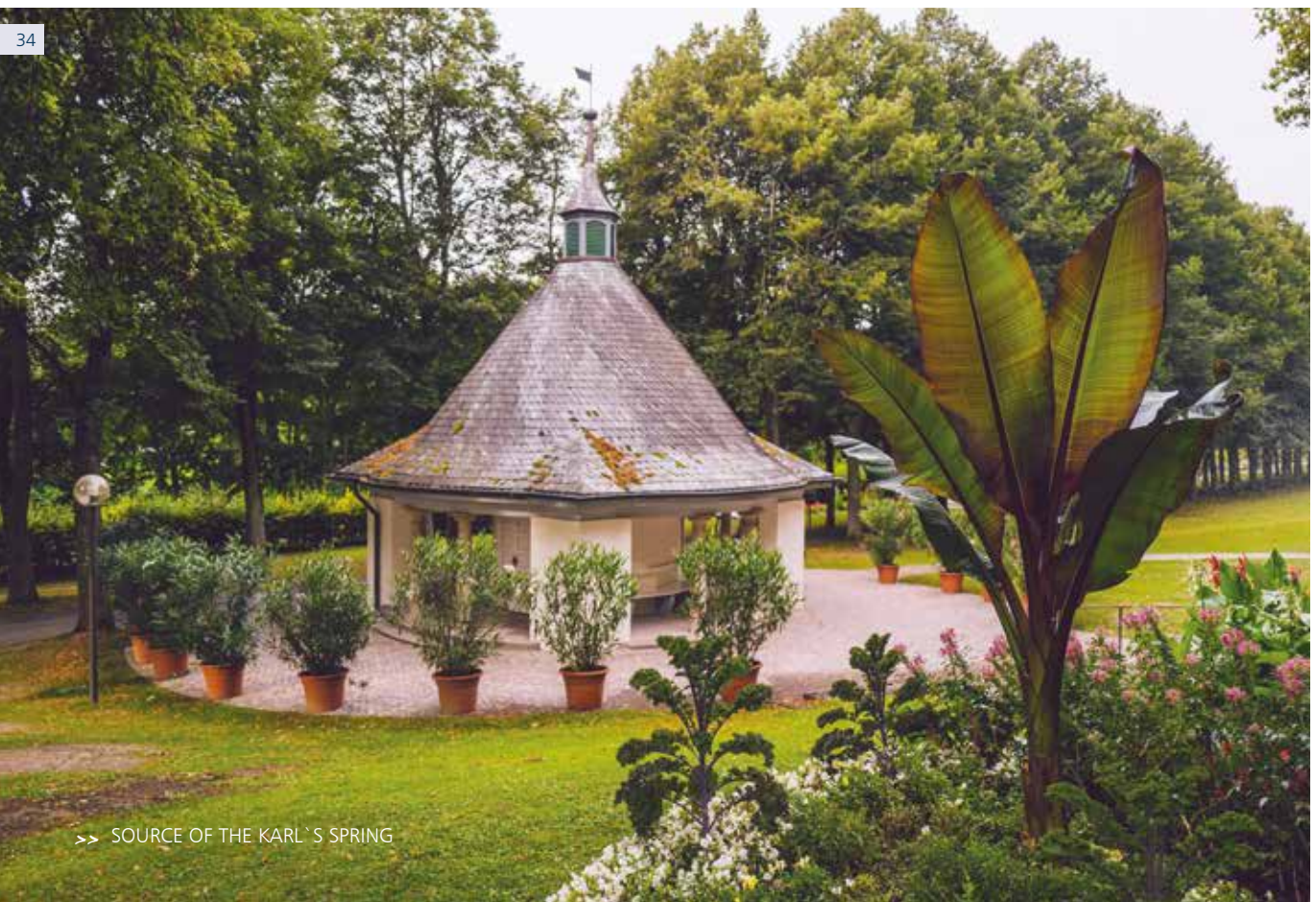
>> SOURCE OF THE KARL'S SPRING