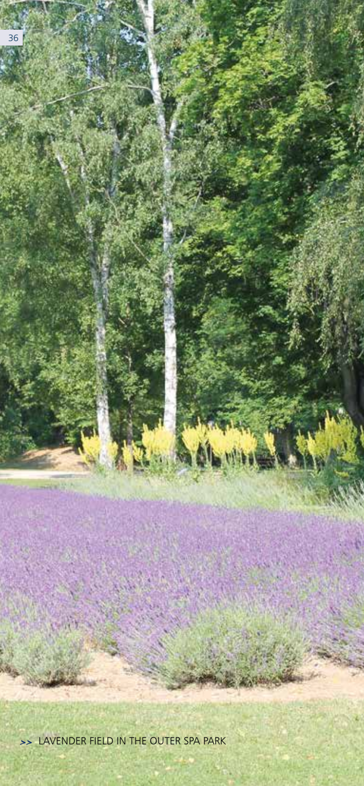
>> LAVENDER FIELD IN THE OUTER SPA PARK