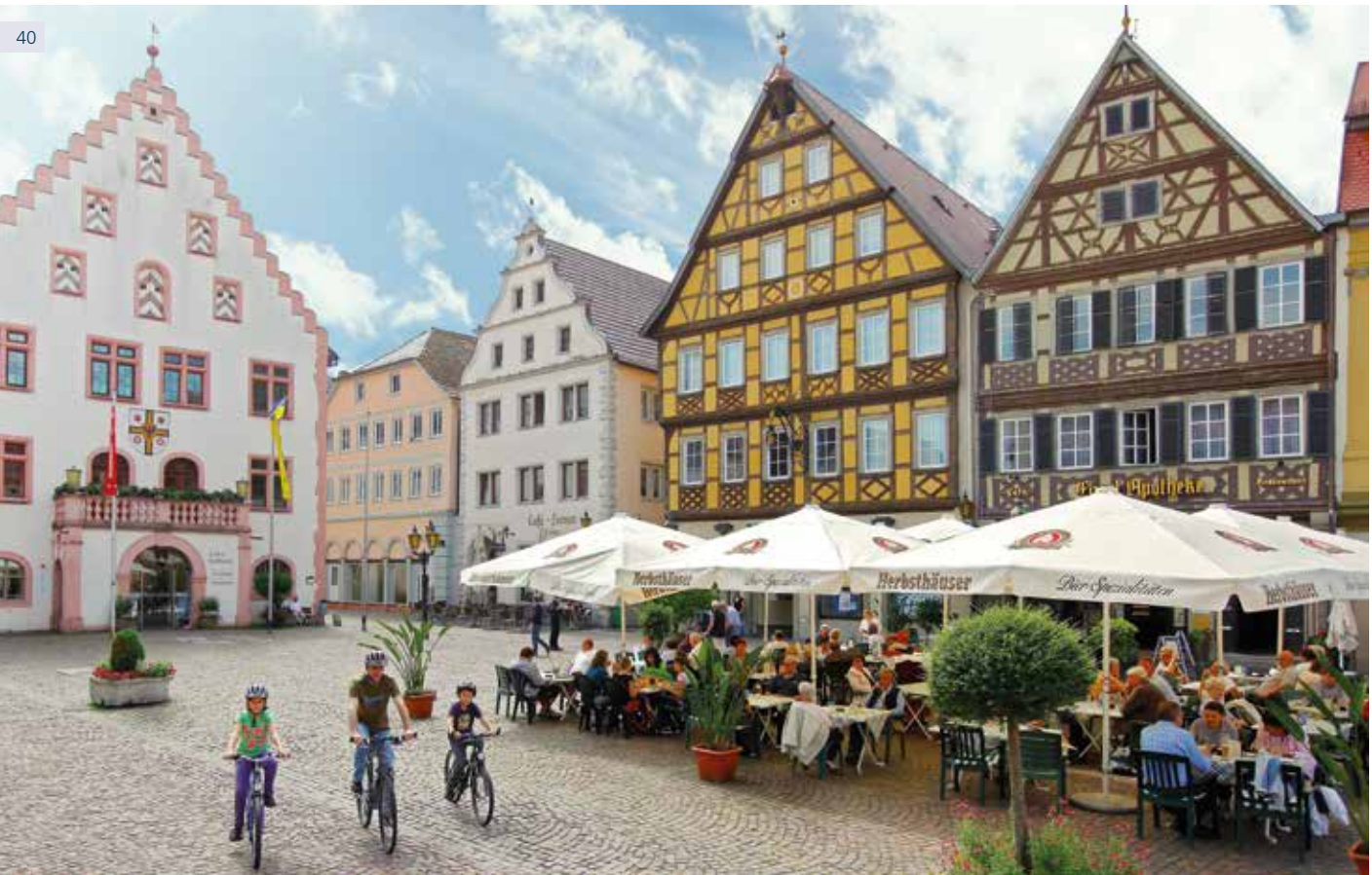
>> OLD TOWN