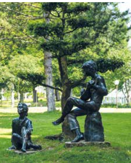
&gt;&gt; LUTE PLAYER AND LISTENER