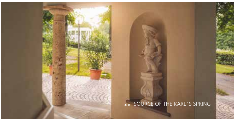
&gt;&gt; SOURCE OF THE KARL'S SPRING