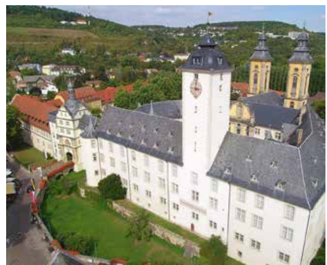
>> RESIDENTIAL PALACE WITH THE MUSEUM OF THE TEUTONIC ORDER

A lovely stroll takes you from the spa park through the palace gardens directly to the historic old town. There you can admire the picturesque half-timbered houses, winding alleyways and impressive churches. The town centre also provides numerous culinary offerings and shopping opportunities.