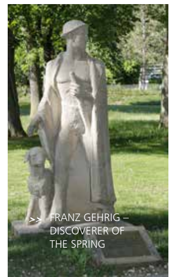
>> FRANZ GEHRIG – DISCOVERER OF THE SPRING